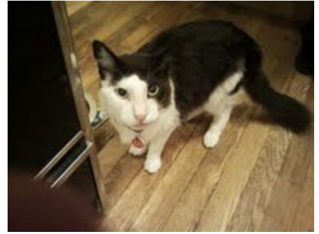
Pretty Boy McTavish

BY MAIL: CHECKS can be sent to Spay and Neuter Solutions, P.O.Box 762, Cortaro, AZ 85652